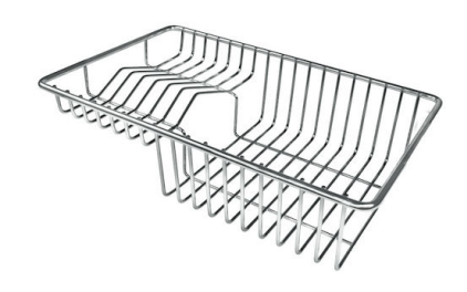
Stainless steel plate rack 8100 303 * only in combination with the accessory 8644 101