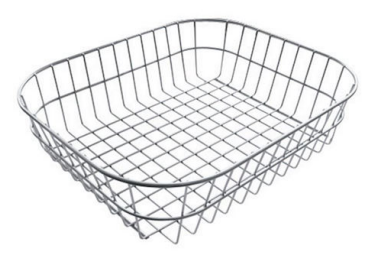
Stainless steel basket 8611 000